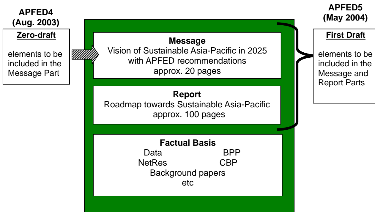
Figure 1 Sequence of APFED drafts

The First Draft consists of two parts; namely the message part with APFED recommendations and the report part that supports ideas to be incorporated in the message part as illustrated in the Figure 1.